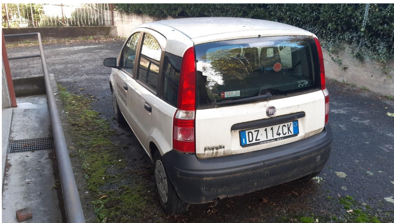
Esterno parte posteriore