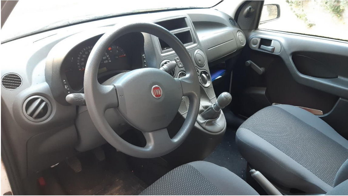
Interno parte anteriore