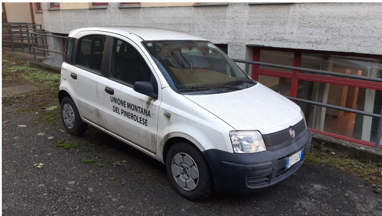
Esterno parte anteriore